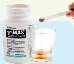
Dosing scoop included

1 scoop = 1/4 tsp of powder = 15 mg of Elemental Iron